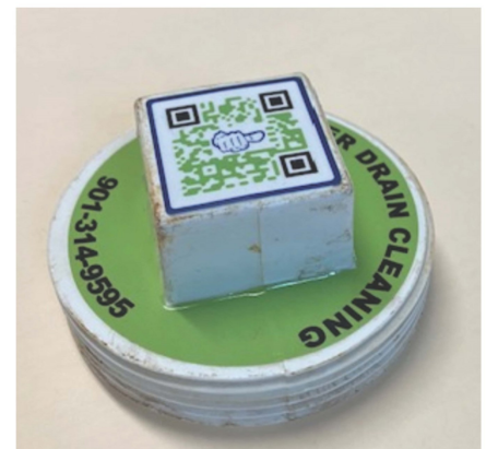
SEWER DRAIN CLEANING