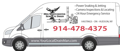
• Power Snaking & Jetting • Camera Inspections & Locating • 24 Hour Emergency Service HASTINGS - ON - HUDSON, NY www.YourLocalDrainMan.com