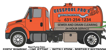
Next Pump Date. SEPTIC PUMPING • LINE JETTING • INSTALLATION • PORTABLE RESTROOMS