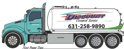
Next Pump Date.