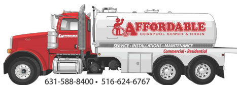
CESSPOOLS • GREASE TRAPS • SEPTIC TANKS • DRYWELLS • SEWER & DRAINS